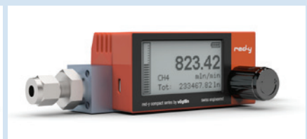
Various Inlet and Outlet Fittings