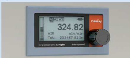
Panel Mounting Kit