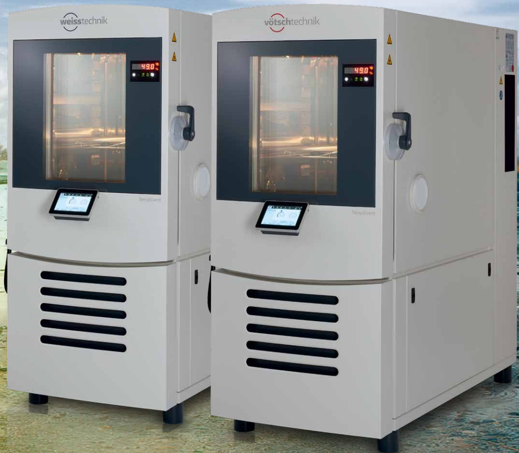
Illustration is similar, contains additional equipment