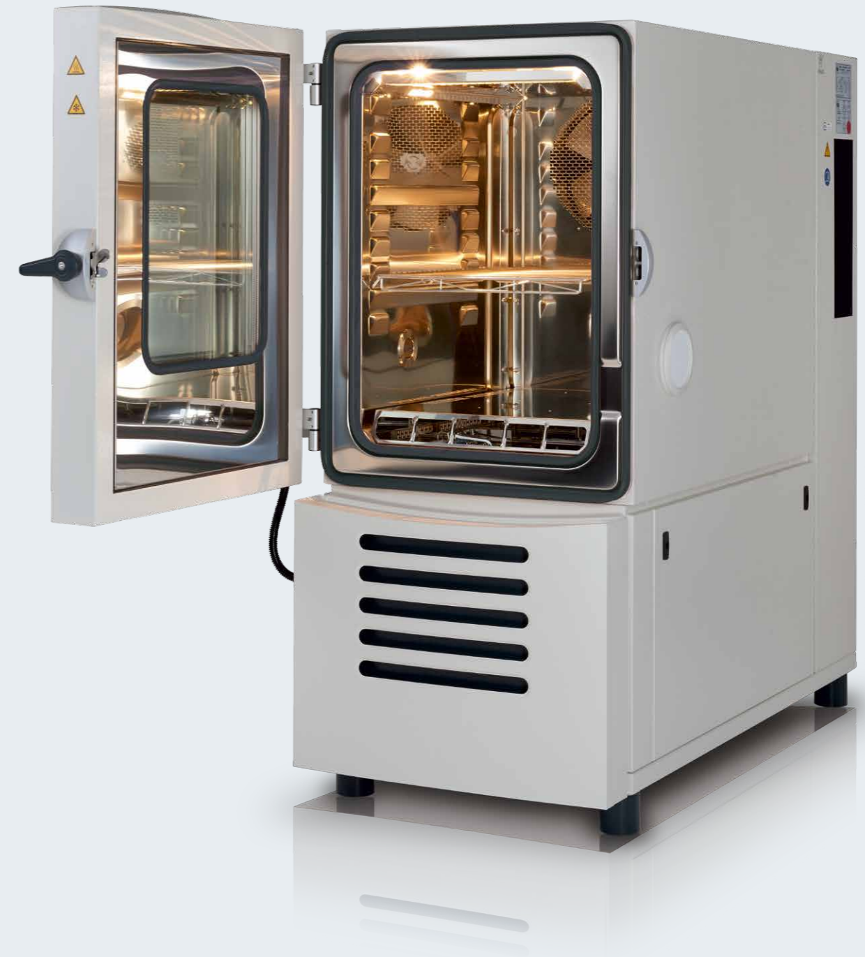
Illustration is similar, contains additional equipment

You can find further details on equipment in our technical descriptions. Contact us.