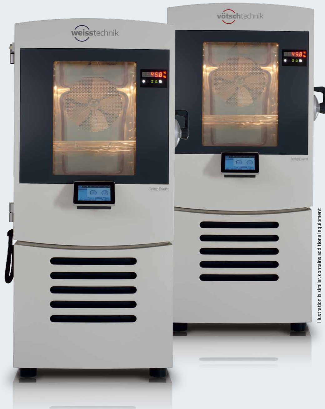
Illustration is similar, contains additional equipment

You can find further details on equipment in our technical descriptions. Contact us.