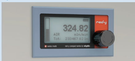
Panel Mounting Kit