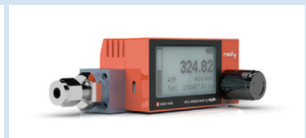
Various Inlet and Outlet Fittings